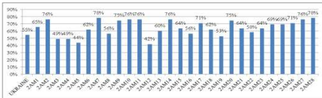
Fig. 3. Application of the WCO Guidelines – the EU and Ukraine compared

Taking into consideration that Ukraine is developing its economic and trade ties with the European Union (further as ‘the EU’), it seems to be worth to compare the state of application of the WCO Immediate Release Guidelines in Ukraine with results of the EU Member States (the EU Member States are not recognised by their name but are randomly identified as the purpose of this paper aims at presenting the level of WCO Guidelines’ application in the Ukraine, not the EU). Below table provides for this comparison (fig. 3).