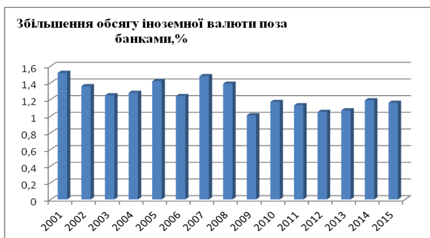
Fig. 3. The rates of height of foreign currency are out of banks during 2001–2015

The data, which brought around to fig. 4, 5, testify to that, at the reduction of balance account of the foreign currency on the savings accounts and on the credit operations in foreign currency grows out the volume of circulation behind banks, that is represented by the structure of money aggregate of M0 [22; 23].