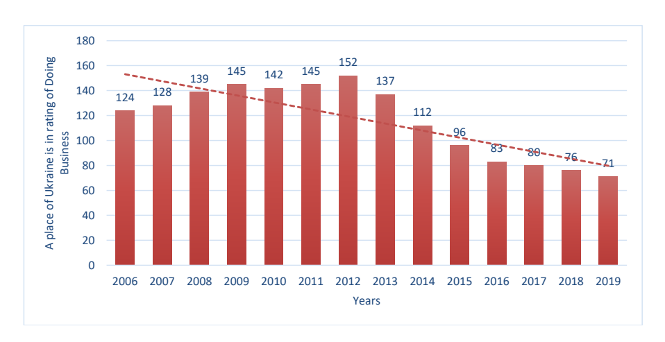
Fig. 2. Ukraine ranking in the ease of doing business among 190 countries (Doing Business 2006 – 2019)

Doing Business 2019: Training and Reform is the 16th issue of the World Bank's Leading Annual Series, which provides an assessment of legal frameworks that are conducive to business expansion and limit it. The following quantitative indicators were used in this study: business creation; obtaining a building permit; connection to the power supply system; property registration; obtaining credits; protection of investors; taxation; international trade; enforcement of contracts; the solution of insolvency. Each specified indicator has certain parameters. At the same time, the data in the Doing Business 2019 report was prepared as of 01.05. 2018. These indicators are used to analyze economic performance and identify successful business regulation reforms, and to identify where and why they have been more effective [7].